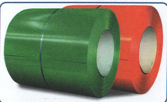
COLOUR COATED COILS